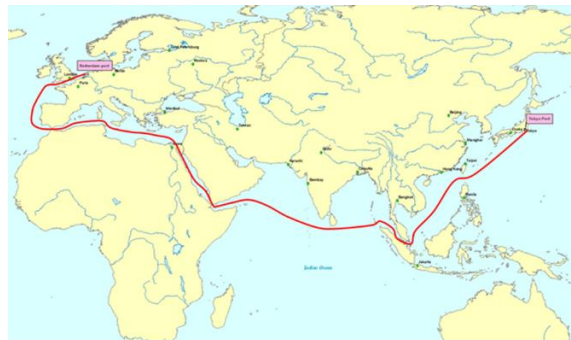
Figure 1. Port of Tokyo to Port of Rotterdam in Scenario A.

Scenario A: Voyage from the Japanese Tokyo Port to the Dutch Rotterdam Port (via the Suez Canal).