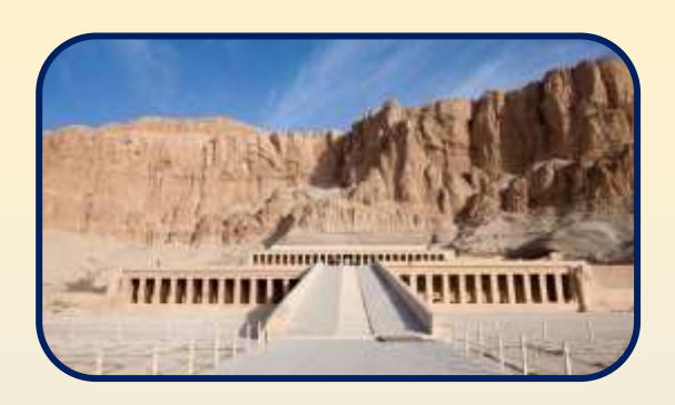
Temple of Queen Hatshepsut

The Valley of the Kings, also known as the Valley of the Gates of the Kings, is a region in Egypt where, during the almost 500-year period between the Eighteenth and the Twentieth Dynasties, pharaohs and great nobles of the New Kingdom of ancient Egypt had their rockcut tombs excavated.