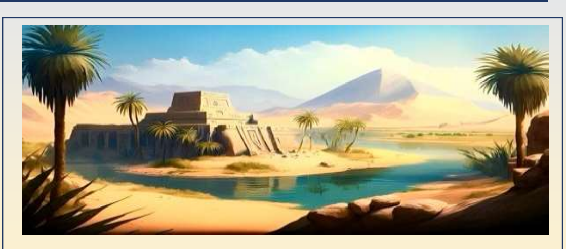
Luxor & Aswan Exceptional Nile Cruise Trip