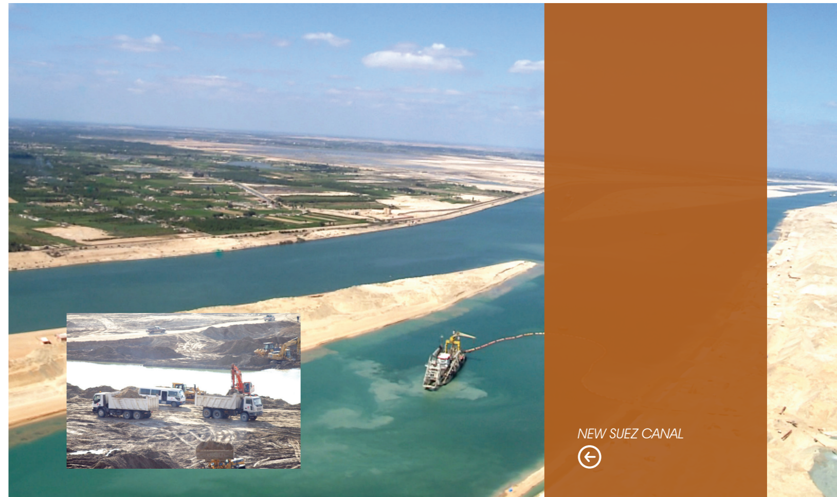
NEW SUEZ CANAL

Starting from small control rooms to Luxury villas, buildings and hotels In addition to large scale Infrastructure Projects, PETROJET remains a step ahead of the competition.