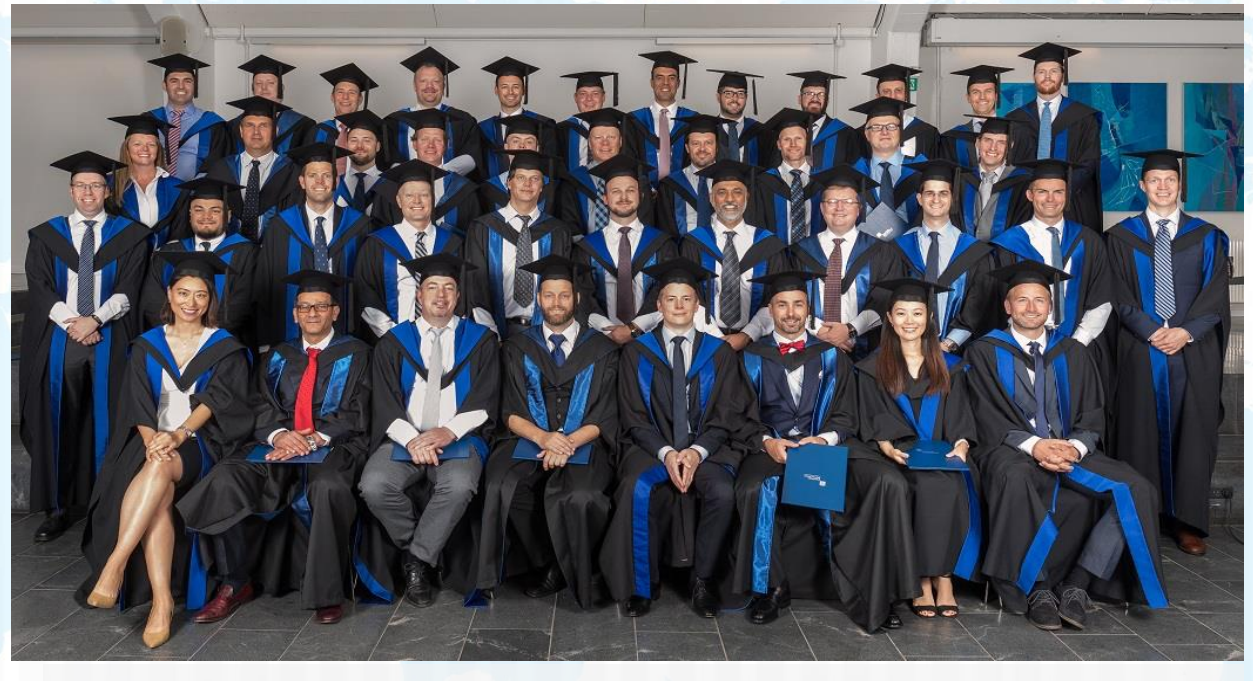
Class of 2017