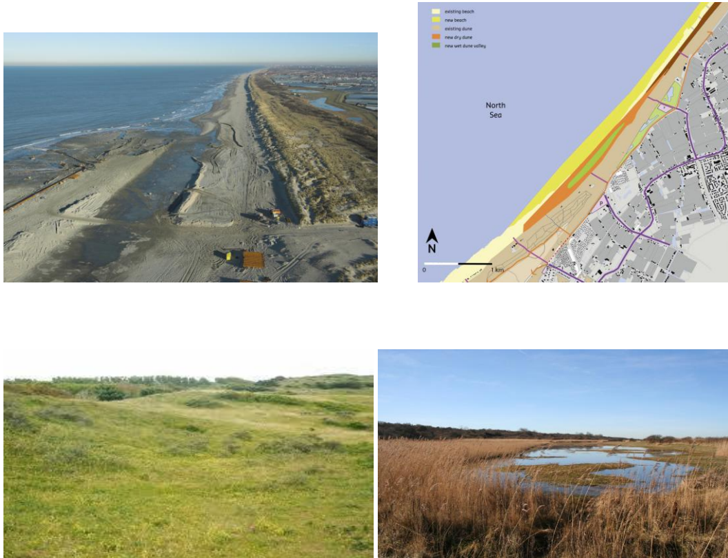
Figure 2. Top left: construction of the compensation area in front of the existing coastal fore dunes (at right) by beach and foreshore nourishment. The contours of the designed elongated moist dune valley, a flat depression, are already visible in the middle. Top right: design of the new dune area in front of the Delfland coast. Grey=existing dune, yellow=new beach, orange=new dry dune, green=new moist dune valley. From Veeken et al. 3 .

to rising fresh groundwater level. Because of sand mobility (see paragraph below), part of the nourished material had to have a specific grain size (180-250 \mu ), which is slightly smaller than the average sea bottom sediment in front of the coast. However, earlier surveys showed that there was enough material present in the neighbourhood.