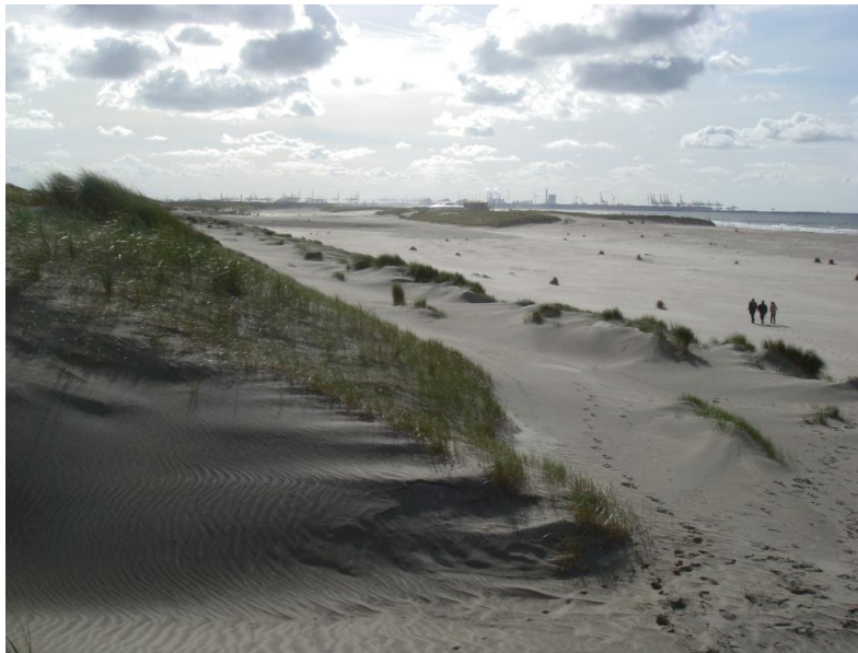
Figure 3. The new area development of Spanjaards Duin (2013). Wind activity is clearly visible. Former (existing) coastal fore dunes to the left New embryo dunes formed by wind and sand captured by Marram grass, in the middle. Prospective wet dune valley and new fore dune ridge to the right. Harbor of Rotterdam (Maasvlakte 1) in background. North Sea (just visible) to the right.

About 7 years after construction, the area is still very dynamic (Figure 3). Vegetation is scarce. But the abiotic conditions for the development of the compensation targets, the nutrient poor dune grasslands, are nearly in place. Signs of the development towards Grey dunes can be seen. The area functions in a number of ways: for coastal defence, nature conservation and also recreation. In the densely populated environs of Rotterdam harbour in the Dutch Delta, this is regarded as a very positive situation. To ensure that nature development can take place, free access is not allowed. The new area is already under Natura 2000 protection.