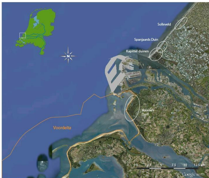
Figure 1. The Netherlands (inset) and part of the south western Delta coast of the North Sea. In the middle the new harbour extension (Maasvlakte 2) in outline. The dunes of Voornes Duin, Kapittelduinen and Solleveld are nearby Natura 2000 areas that will suffer expected environmental damage. Spanjaards Duin, in the north, is the new dune and beach compensation area. In the south in the Voordelta (a shallow sea in front of the coast, also a Natura 2000 area) is the area where marine compensation measures are taking place (yellow boundary). Image: Google Earth.

The case of Rotterdam is of importance to mirror with harbor development worldwide to achieve innovative smart solutions in a more sustainable way. Key concepts are compensation of irreversible damage to nature and building with nature.