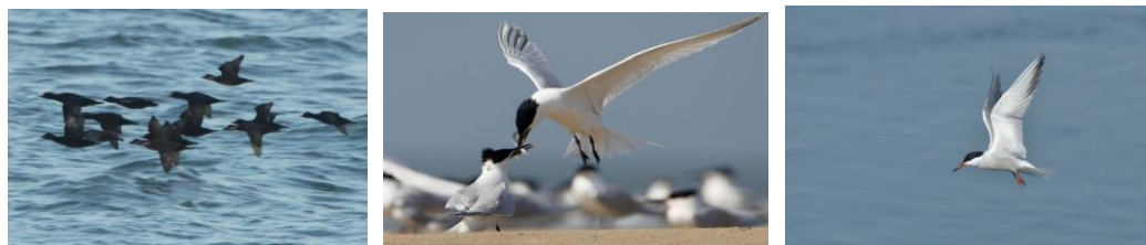
Figure 4. Top: Marine compensation in the Voordelta (orange boundaries) and the marine protection area (red) and the resting areas for seabirds (yellow). Bottom: from left to right Common scoter, Sandwich Tern and Common Tern.